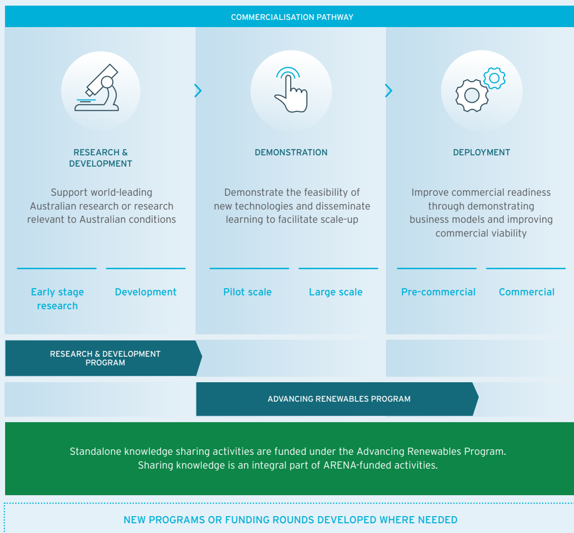
Figure 1 – Supporting innovation and commercialisation

ARENA-funded activities are required, where appropriate, to share knowledge. This increases the return on public investment by extending the impact of ARENA financial assistance beyond the proponent to the broader industry.