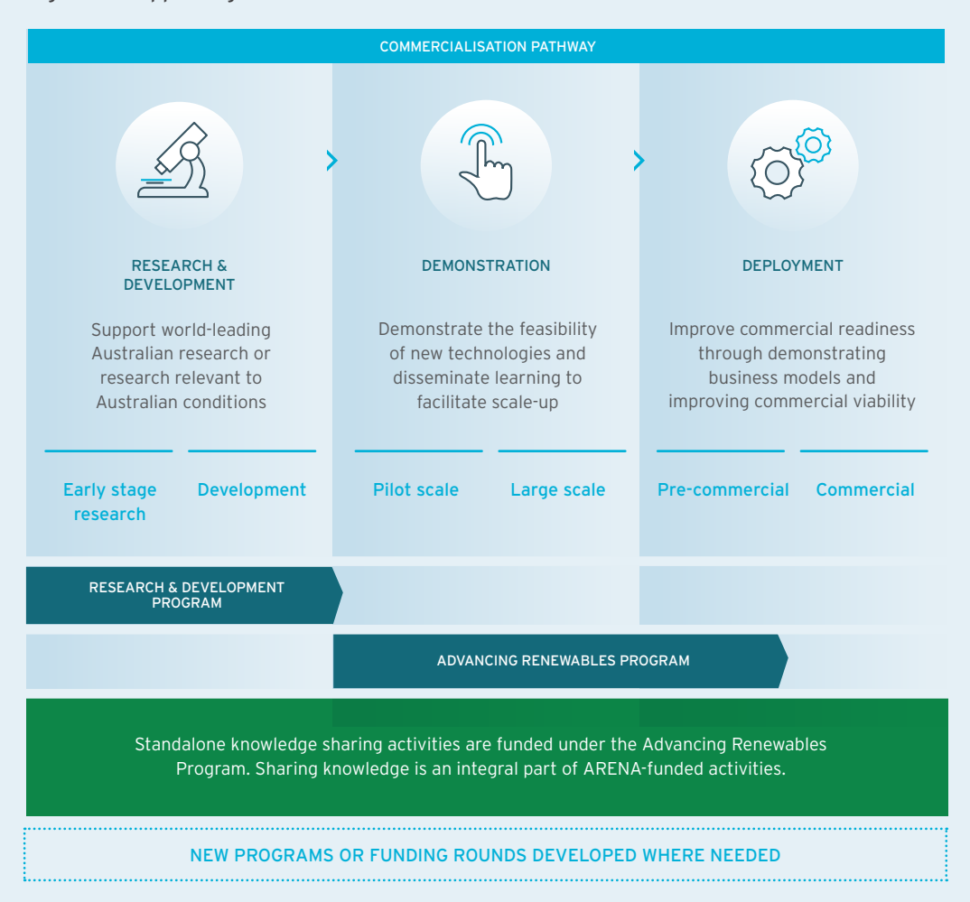
Figure 1 - Supporting innovation and commercialisation